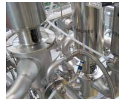
CIP run-off for sampling valves protects fittings and pumps (left)