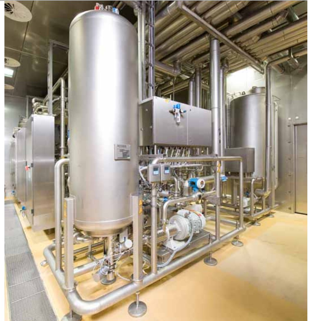
VarioAsept J – media connection