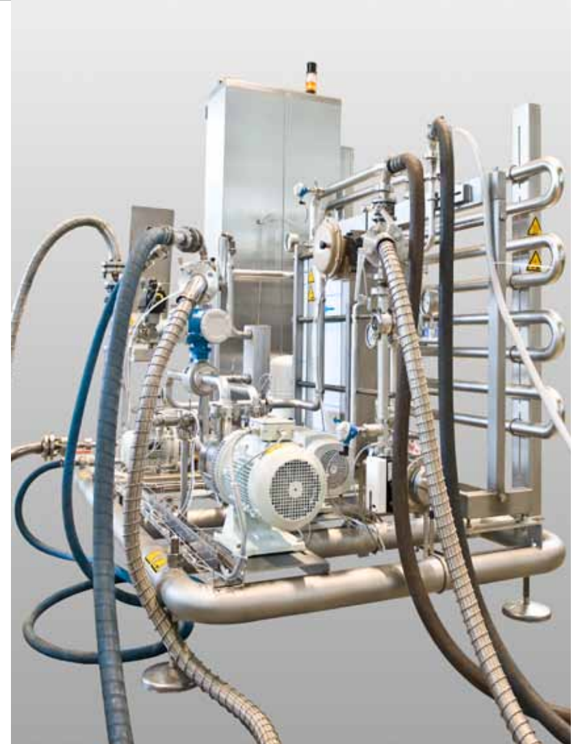
VarioFlash B in the FAT (Factory Acceptance Test)