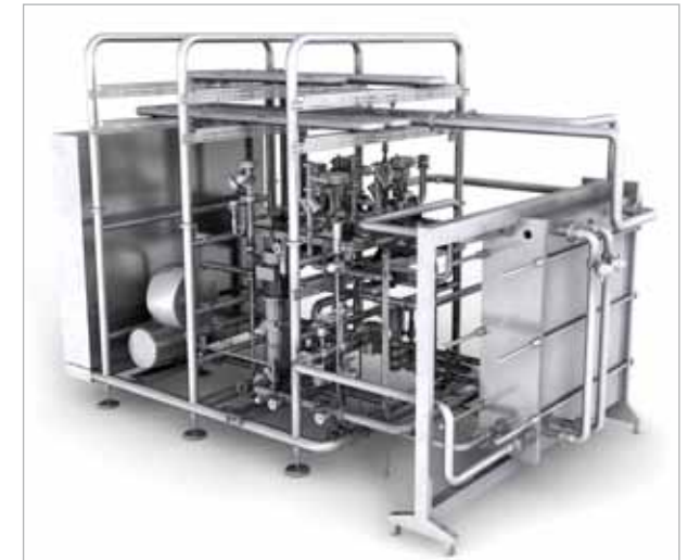
Plate heat exchanger

The CIP run-off for sampling valves prevents damage to the electrics and pneumatics caused by cleaning agents, while the CIP collecting pans in the complete module facilitate run-off of the cleaning media.