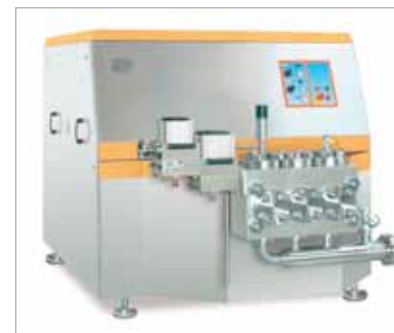
The homogeniser ensures a uniform product composition, guaranteeing uniform heat transfer in the heating phase.