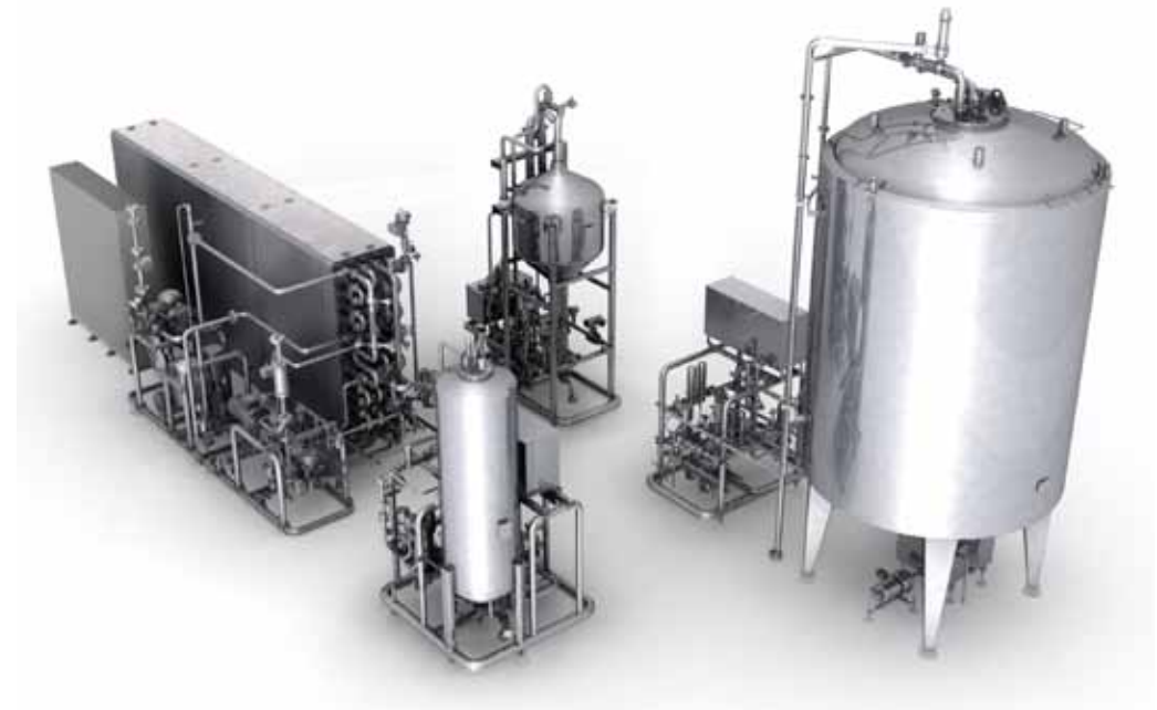
VarioAsept M – comprising media connection, tubular heat exchanger, product deaerator and buffer tank

In addition to the heat exchanger, the media feed, deaerator, buffer tank and homogeniser modules are also used. All modules ensure the absolutely leakproof separation of product, CIP media and process water, allowing mixing of the media to be precluded.