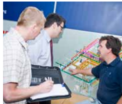
The customer and KRONES engineers in detailed clarification