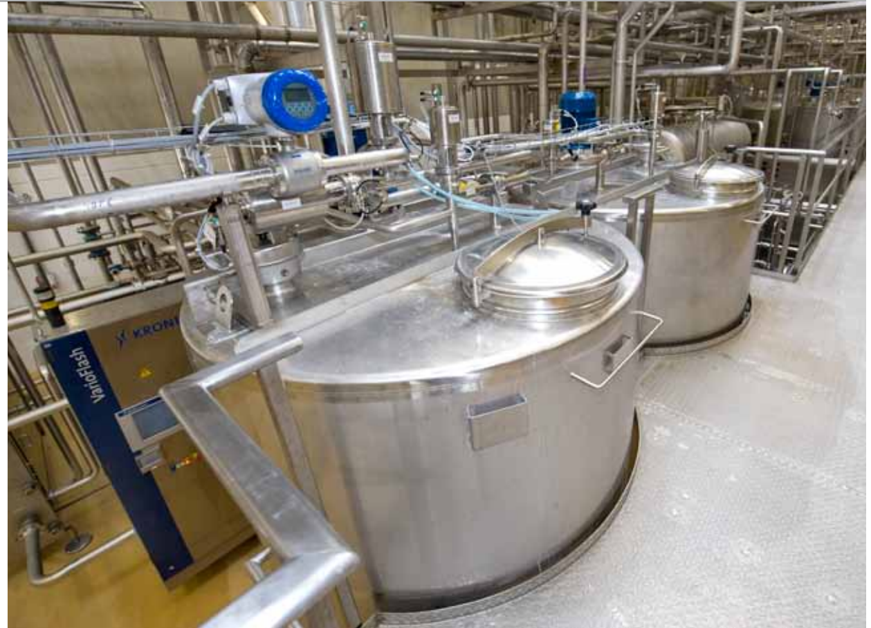
VarioFlash J in the syrup station

Depending on the product intake temperature and the customer's requirements, an up to 100 % recuperative circuit can be set up for cooling after heating, or an additional cooling heat exchanger can be integrated.