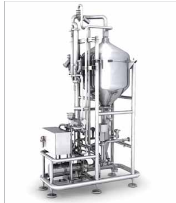
The compact deaerator unit

The compact design of the system allows only a low product quantity to be processed in the system at any time. The plus points of this concept include excellent deaeration figures and the avoidance of temperature damage and microorganism development before the heater stage.