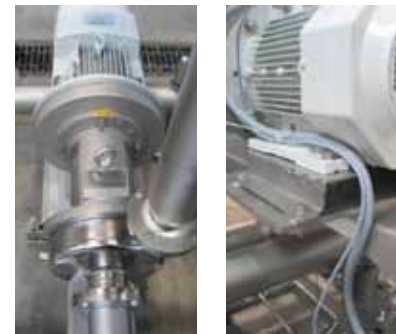
Quick-change device for the pump's mechanical seal