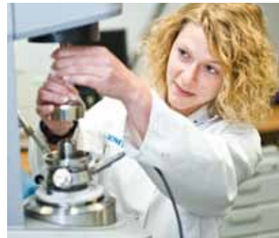
Determining viscosity with the rheometer

Product characterisation as a planning basis for thermal product treatment can be carried out in the KRONES process laboratory. Product samples are analysed for pulp and fibre proportion and size and their dynamic viscosity, thermal conductivity and ingredients are determined. Product data are backed up on a case by case basis by test series in the process pilot plant. The systems are configured to meet the customer's specific requirements. The thermal product treatment systems are fully assembled and extensively tested in the assembly hall. This allows all programs to be run under real-life conditions (temperature, pressure and volumetric flow) so that the customer has minimum on-site installation and commissioning expense.