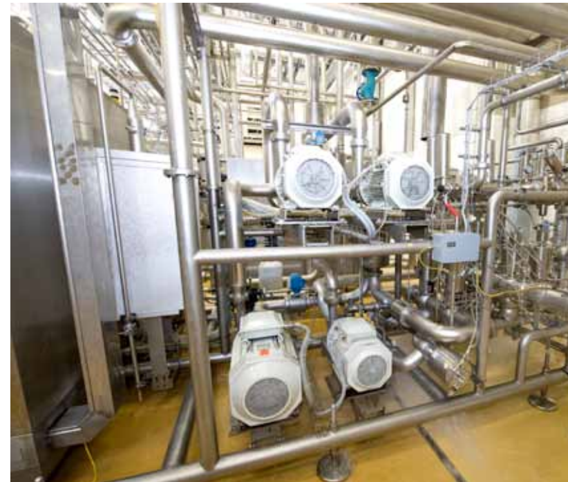
All pumps are positioned for easy access on one side