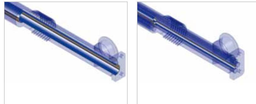
Monotube (left) and multitube (right) with three-layer bel- lows for material elongation